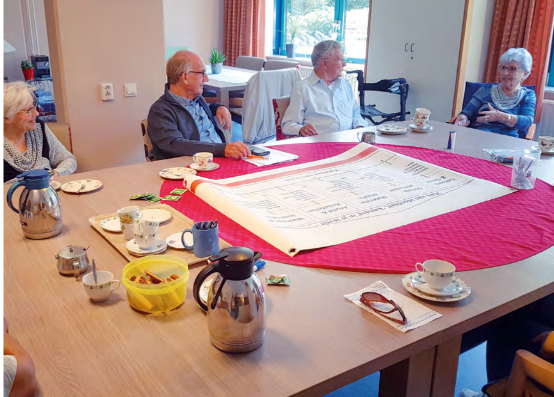
Participants supported each other by sharing knowledge and their life experiences.