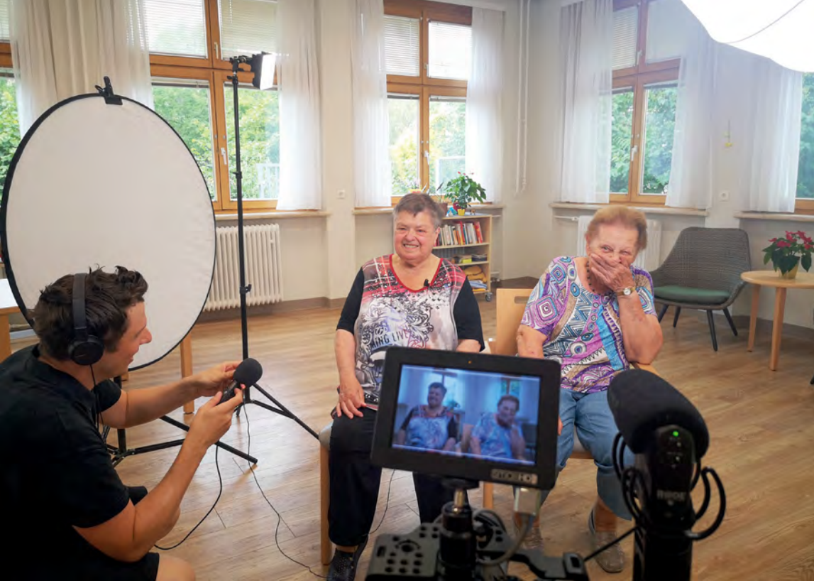
Participants of the neighbourhood group at the pensioners club Hofferplatz in Vienna sharing their perspective on the “Plaudereien” (chats) in a short video. After initial scepticism, they visibly enjoyed the video shoot. See the video here: → www.youtube.com/watch?v=GlrLJ-_jcKY